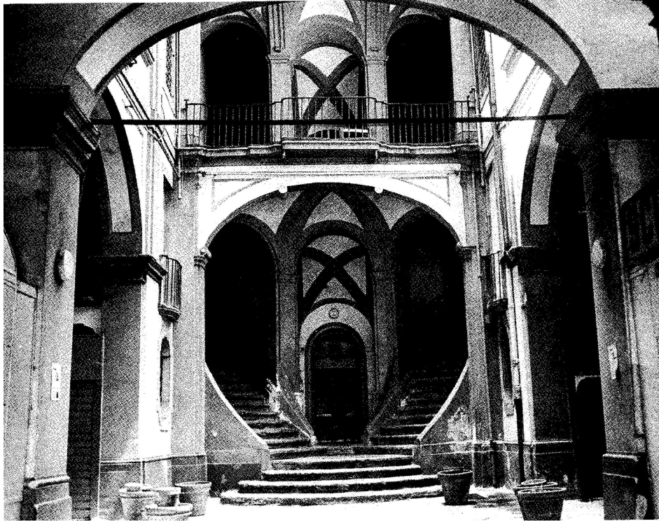
Napoli, palazzo Mastellone. L'invaso del cortile e l'invito della scala aperta.